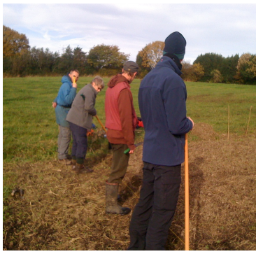
Planting Onions: Nov 2010. There'll be more work days in the spring.